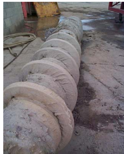
Extracted Displacement Pile