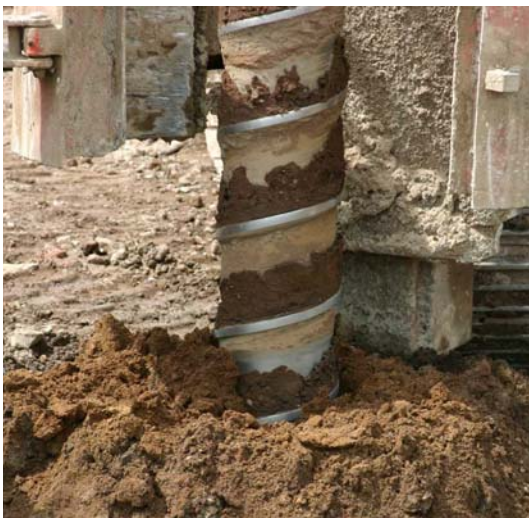
Minimal Spoil At Surface