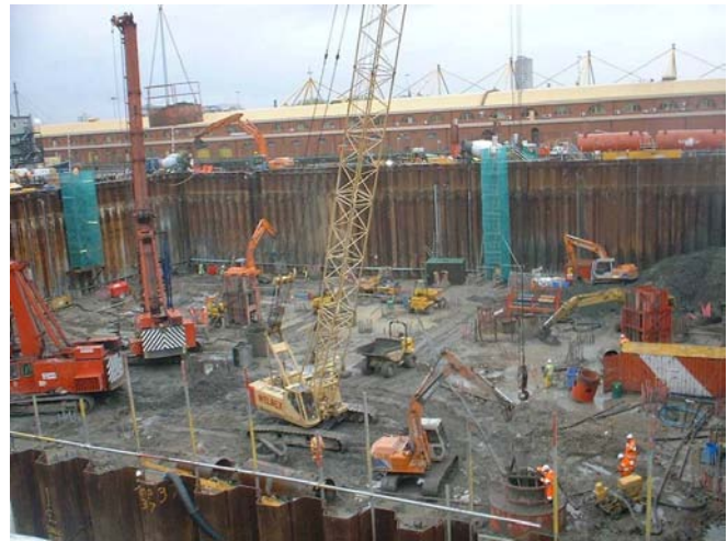
BP1 Canary Wharf, London

In recent years Polymer support fluids are increasing being used as a bored pile support fluid, as an alternative to the more traditional bentonite. A number of benefits have been offered including, reduced environmental impact, faster mixing, reduced mixing and storage areas, cleaner site and work area, and lower disposal costs. A more complete list of the benefits of Polymers support fluids over bentonite is given overleaf.