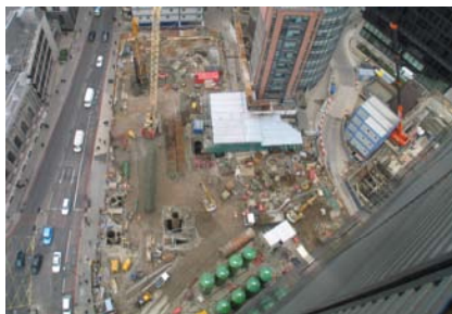
Piling through existing basement

Much effort was put into the project in the early design stages to ensure a foundation solution that was simultaneously robust, efficient and buildable. The design team considered numerous foundation options to carry the 20MN to 45MN megaframe column loads, including groups of straight shafted bored piles founded in the London Clay, underream piles, hand dug caissons and deep piles founded in the Thanet Sand. Even a piled raft combining new and old piles over the whole site was considered in the early design stages, with piles founded in the London /Lambeth Clays.