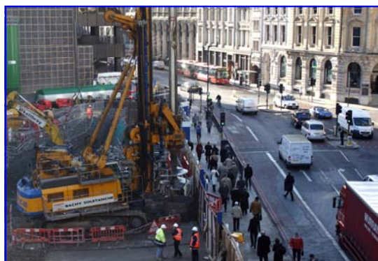
Piling in the City of London