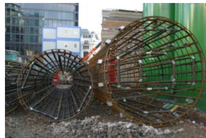
Single & Double TAM circuits developed for base grouting

Being more than 3 times the height of the previous buildings on the site and of irregular shape, The Pinnacle did not lend itself easily to reuse of the existing foundations. However, through a value engineering exercise, the design team were able to identify a large number of piles that could be reused to support the more lightly loaded columns of the building, resulting in savings to the project in excess of £300,000 and substantial lorry movements.