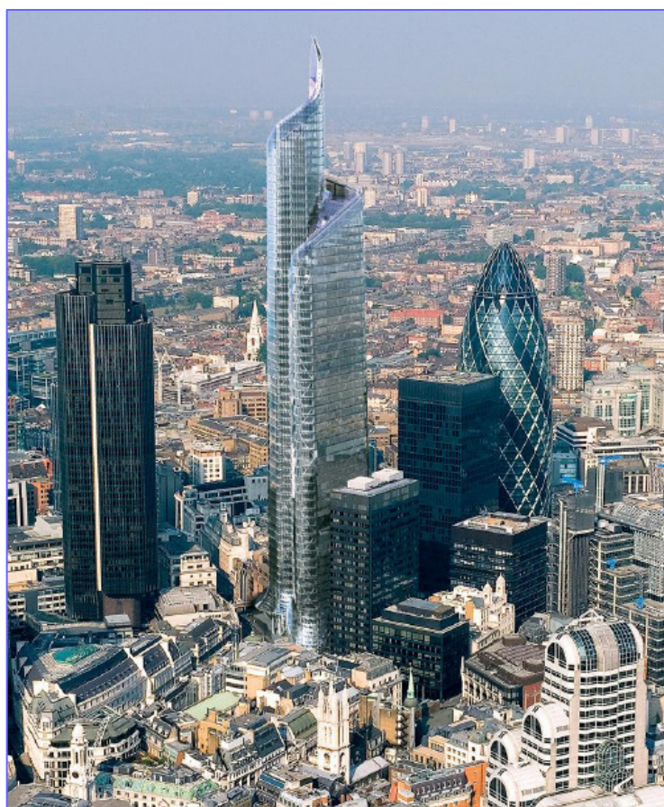
The Pinnacle Tower

At 65m deep, and founded in the Thanet Sand stratum, the piles were constructed under bentonite support fluid. The piles are believed to be the deepest ever constructed in the UK, and the largest diameter (up to 2400mm) ever to be base-grouted in the world.