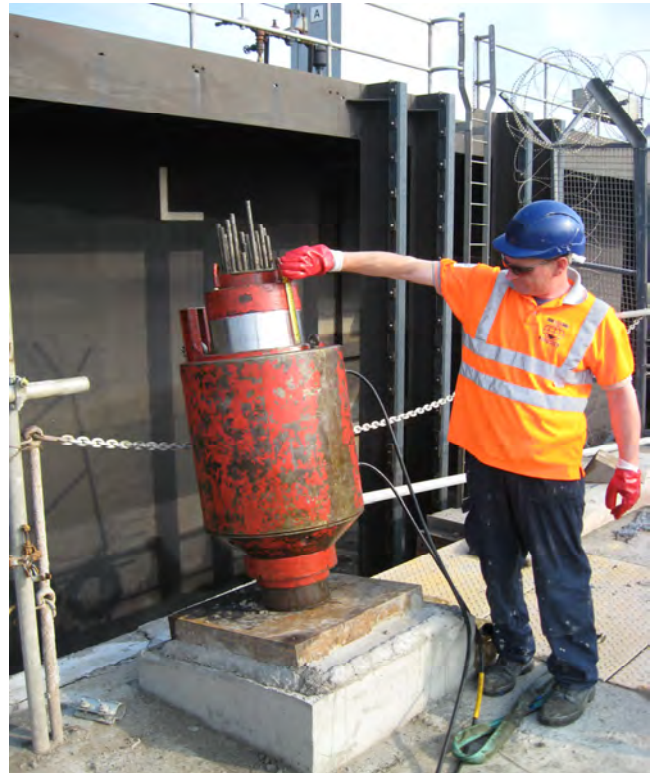
Stressing of Ground Anchors

The dowels were modelled in different ways in a series of WALLAP analyses for the design of the secant pile wall to determine the effective 'prop' load to be provided by the dowels. A number of potential failure mechanisms were considered in the design of the dowel, with the dowels checked in shear and in tension.