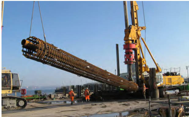
Secant Pile Reinforcement Cage with Reservation tube

Reservation tubes were built into the reinforcement cages for the male piles, see below. The design required that a 240mm diameter bore be extended 2.0m into the Dolerite at the pile toe to accommodate a 210mm diameter x 4.0m long steel dowel.