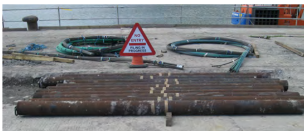
Steel Dowels prior to installation

The secant pile wall was installed through 26m of made ground into the top of the Dolerite rock. The dowels then extended 2m into the strong Dolerite.